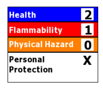
HMIS RATINGS (0-4)